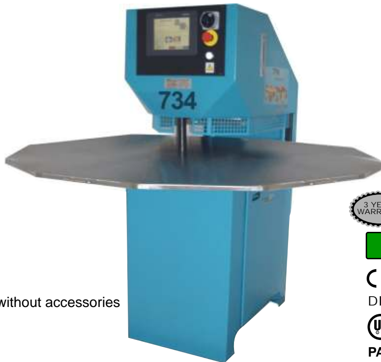
photo without accessories

TPM 734 full-automatic, hydraulic machine ECOflex with revolving table